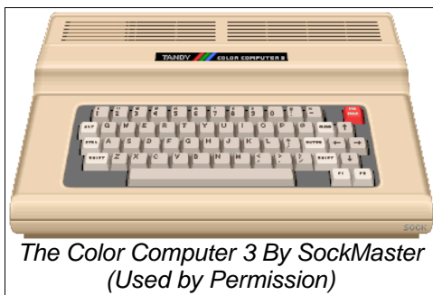
The Color Computer 3 By SockMaster (Used by Permission)

The Color Computer (affectionately known as a CoCo and formerly sold by Tandy) has got to be the most underrated computer ever made. It was based on the Motorola MC6809E. The circuit used for the original CoCo 1 was, almost part for part, shown in the Motorola spec sheet for the SN74LS783 - MC6883, a synchronous address multiplexer (called by CoCoists a SAM.) The third major chip in the CoCo was the MC6847 Color Video Display Generator.